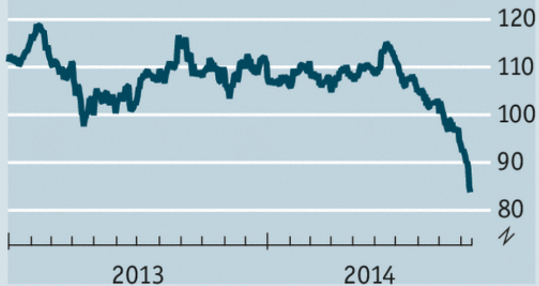
Brent crude oil price, $ per barrel